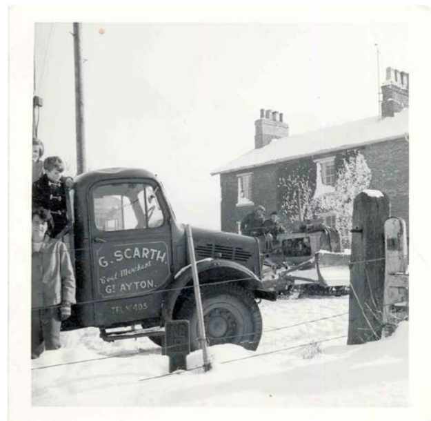
1950's photograph of G Scarth Coal Merchants who were based on Newton Road