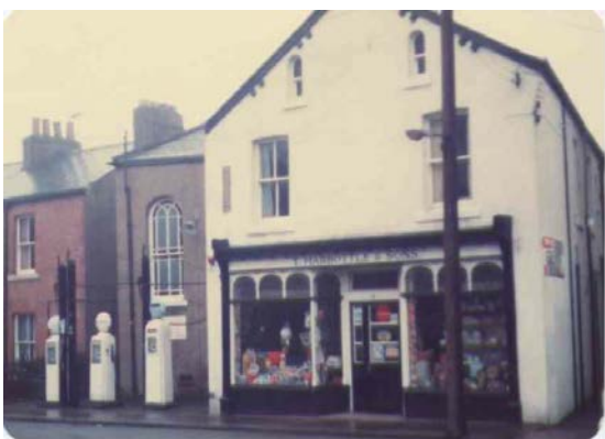
1970's – 73, Newton Road T Harbottle hardware shop which became a Landrover dealers and finally was converted to a private house