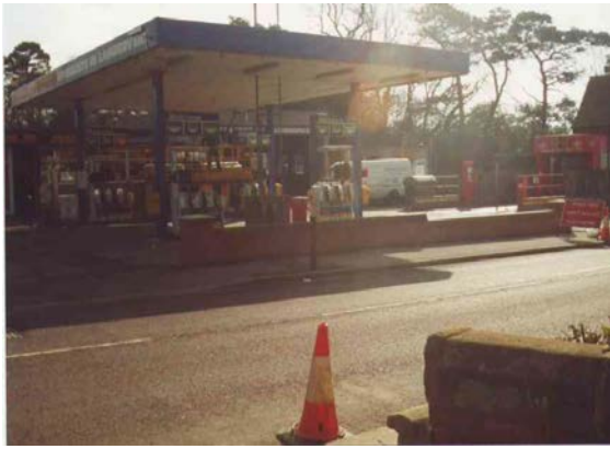
1970's – 44, Newton Road, AMR Autos (Andrew Reid) Across the road from 73, Newton Road

In the 1990's the garage was sold and AMR Autos moved to Stokesley. The land was used to build 12 flats – named 1-12, Roseberry Court.