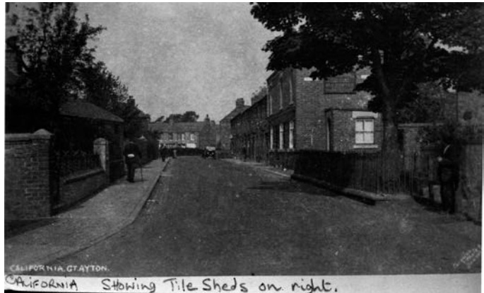
1930's – Showing the Tilesheds pub