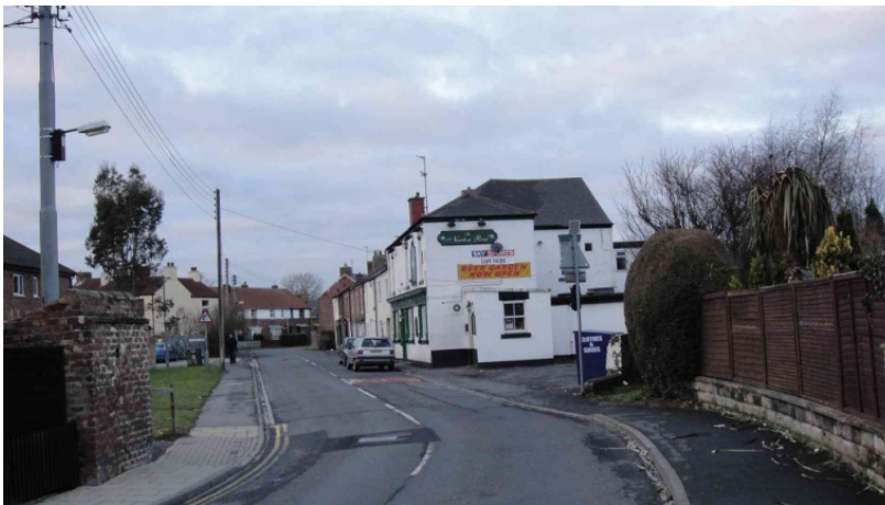
Looking towards the Newton Rose Pub